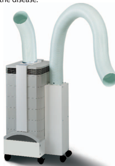
The customised IQAir® filtration solution for the Hong Kong Hospital Authority combines an IQAir® filtration system with the FlexVac™ source capture kit and special flexible OutFlow™.

filtration process. At the final filtration stage IQAir®'s independently type-tested HyperHEPA® filter removes even the tiniest of airborne microorganisms, including the SARS virus, with an efficiency in excess of 99.5%. As a result the risk of infection within the patient's room can be greatly reduced, thus providing a safer working environment for health-care personnel and limiting the risk of spreading the disease.