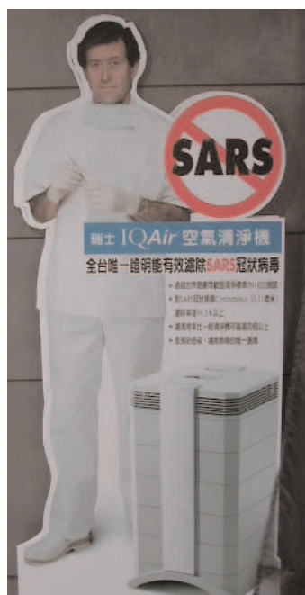
Taiwanese IQAir® display.

It is clear that vigilance for SARS must be maintained, because resurgence of the virus is possible. As a world leading manufacturer of mobile air cleaning systems IQAir® feel honoured and privileged to be able to play an important part in providing professional air cleaning solutions for the fight against SARS and other airborne infection control challenges.