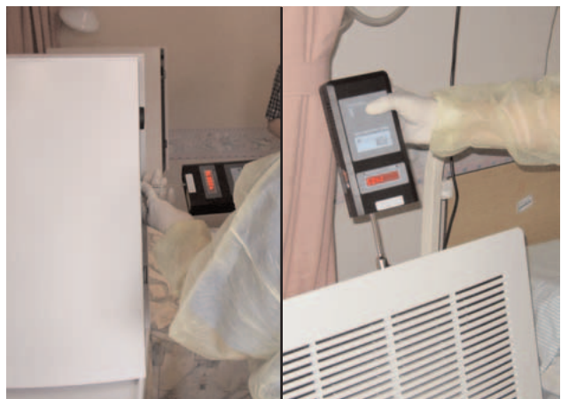
A Senior Engineer of the EMSD assesses the actual filtration efficiency of two air cleaners with a laser particle counter. The majority of conventional air cleaners failed the efficiency test.

In order to find the most efficient, reliable, flexible and cost effective solution, the Electrical and Mechanical Services Department (EMSD) of the Hong Kong Government performed rigorous tests on behalf of the HKHA. They evaluated the suitability and performance of many filtration systems, including IQAir®. With the help of a laser particle counter the EMSD tested the actual filtration efficiency of each filtration system.