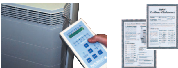
Each IQAir® HEPA filter system is individually tested for filtration efficiency and air delivery. The actual test results are documented on a numbered test certificate.

The efficiency tests revealed that most of the air cleaners failed to remove airborne particulates with the required actual efficiency in excess of 99.97% for particles of 0.3 \mu\text{m} and larger. With its certified and independently type-tested filtration efficiency IQAir® passed this test. After the preliminary selection process, it was the EMSD's aim to select an infection control system that could be put into action in a matter of minutes and that would be able to effectively limit the threat of airborne disease transmission from a SARS patient to health-care workers by providing reliable and certified actual filtration performance.